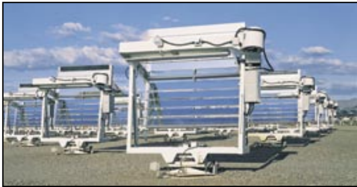
Extreme natural exposure conditions accelerate product weathering, two to three times faster than normal locations.