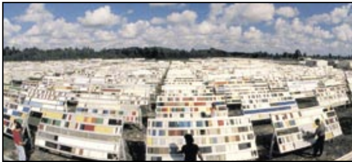
Specially designed test panels at the Atlas Weathering Services Group site in Florida, U.S.A.

Scott Bader's rigorous development programme ensures that all new gelcoats are tested under the most extreme conditions, including 12 months south facing exposure in Florida. Under these intense conditions, Crystic Envirotec LS 30PA displays excellent weathering characteristics, making it an ideal choice for demanding exterior applications.