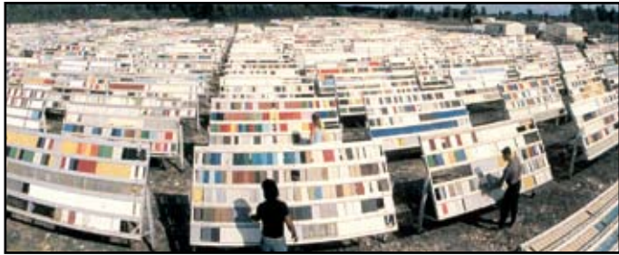
Specially designed test panels at the Atlas Weathering Services Group site in Florida, U.S.A.

To ensure results are consistent, colour change from weathering is measured in-house using the CIElab colour model to measure any colour shift.