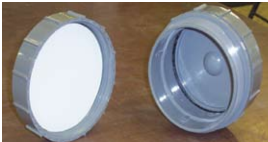
Circular gelcoat panels used for blistering testing.