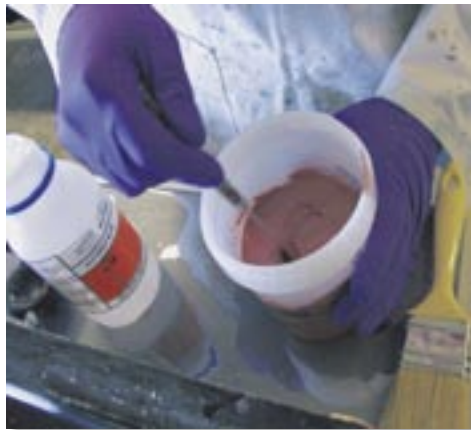
Thoroughly stir in the catalyst to ensure uniform catalysing of the mixture