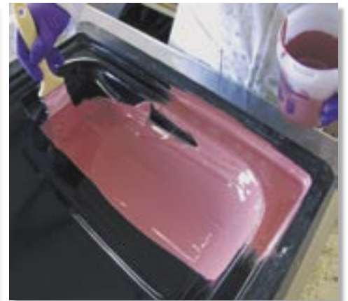
Brush (or spray) onto mould ensuring any trapped air is removed