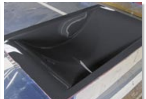
The protected mould is now ready for further use. It is essential to check that the degree of release is acceptable prior to using the mould in production.