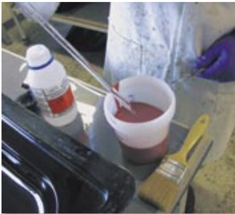
Accurately measure 2% catalyst and add to Crystic Mouldguard

Crystic Mouldguard should be applied at a thickness of 0.5 - 0.6mm. This means approximately 600-700g/m 2 of Crystic Mouldguard will give the required thickness when evenly applied.