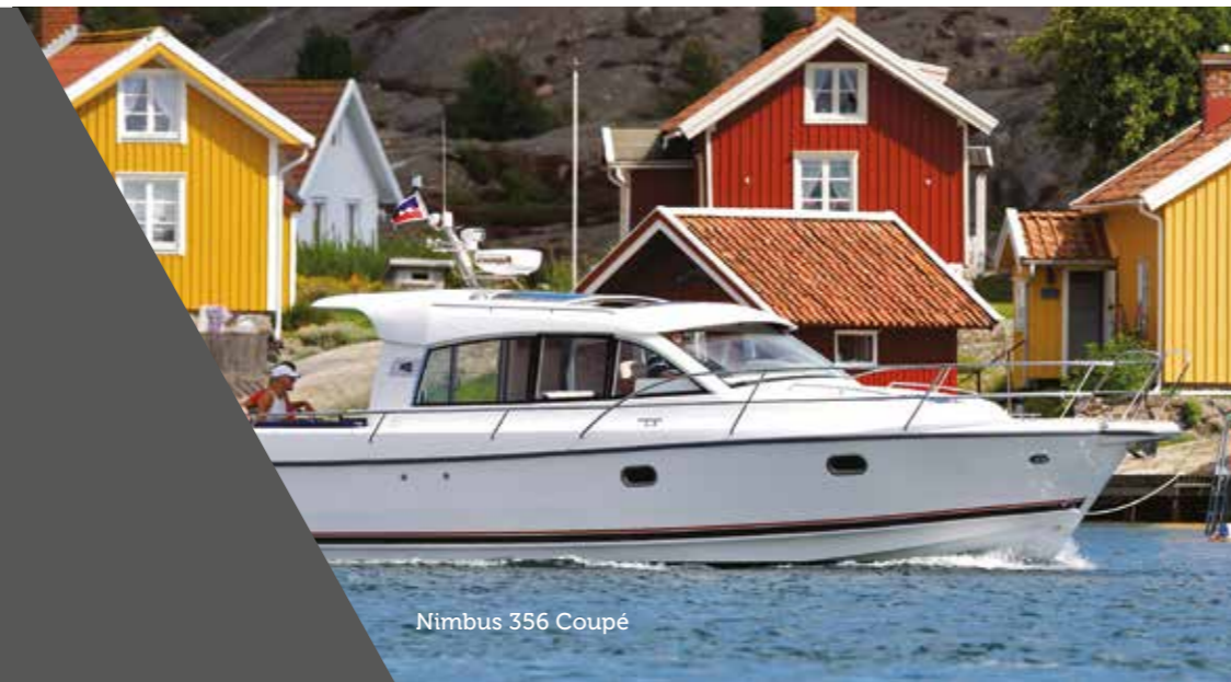
Nimbus 356 Coupé